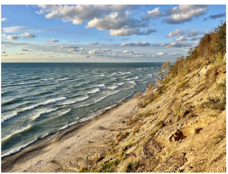
A 100-year, $1 billion agreement between the cities of Chicago and Joliet will transport water from Lake Michigan through a 31-mile pipeline.

Inside the plans for a pipeline between Joliet and Chicago.