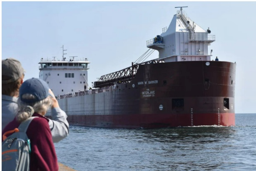
The Mark W. Barker coming into the Twin Ports on Tuesday, Sept. 6, 2022.