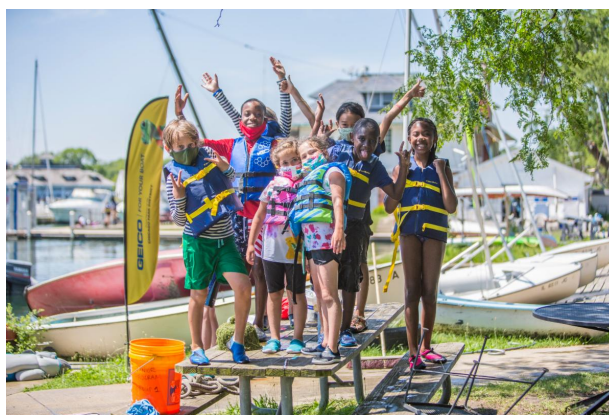
(Kids enjoying JPYC youth sailing program.)